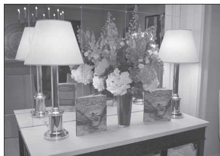
Rice & Rocks on display at the private reception