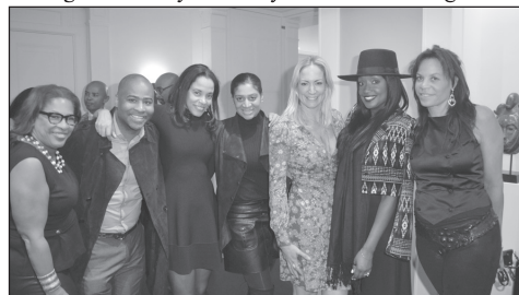
Book signing guests